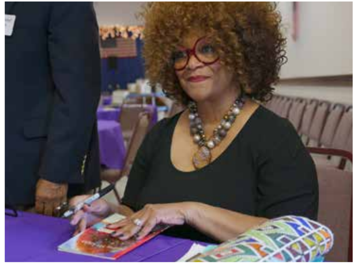
Author and NC Poet Laureate, Jaki Shelton Green, signing her books for fans at the 2019 Fall for Literacy Luncheon.