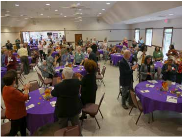
Enthusiastic crowd enjoying the 2019 Fall for Literacy Luncheon at the Western Senior Center in Siler City.