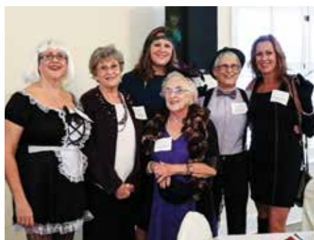
Fall for Literacy Luncheon attendees in costume