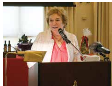
Author Frances Mayes at the Spring for Literacy Luncheon