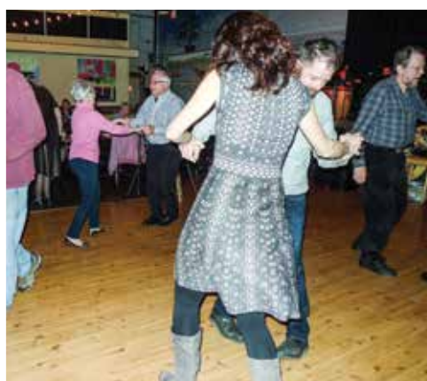
Literacy Swings rocked!