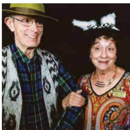
Literacy Swings attendees in costume