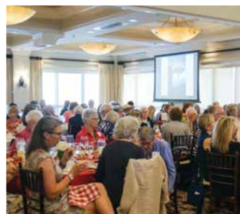
Full house at the Spring for Literacy Luncheon