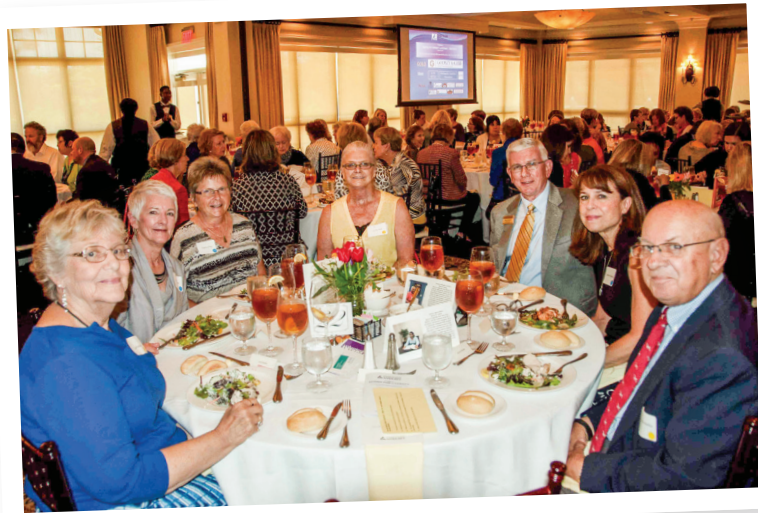
Renowned Southern author, Lee Smith enchanted the audience at the Spring for Literacy Luncheon.